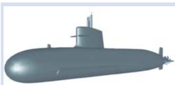
NAVANTIA S80 SUBMARINE IMAGE

Similar to the original Kockums design that had additional hull rings (or 'cans') in-